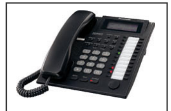
Units available in Black and White