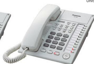
■ KX-T7750 Monitor Unit