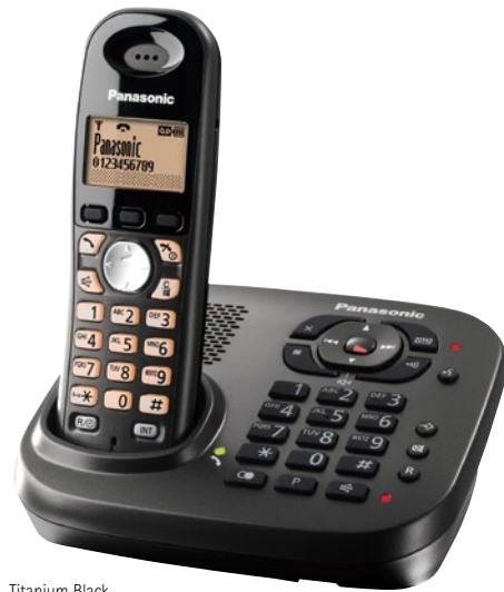
Titanium Black Photo: Europe Model